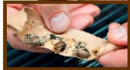
No drilled holes