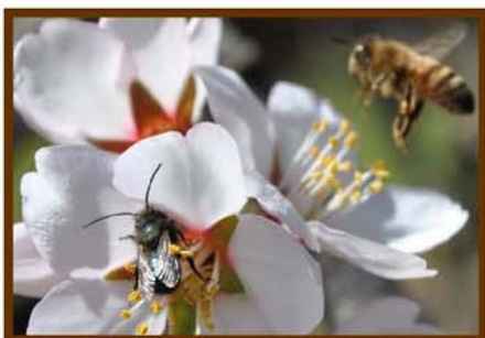
When teamed with mason bees, honey bees are more efficient pollinators.

The gentle-natured mason bee, native to North America, is an excellent supplement to the troubled honey bee. The problem is we need more of them and other solitary bee pollinators.